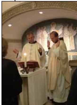
Mass in a crypt chapel in St. Peter's Basilica